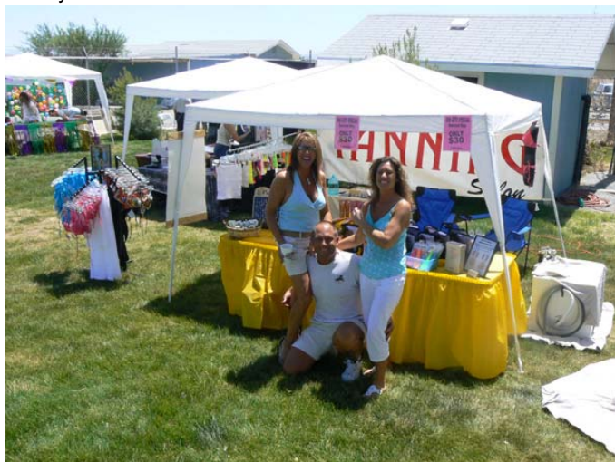
Radiance Tanning was a big hit with attendees.