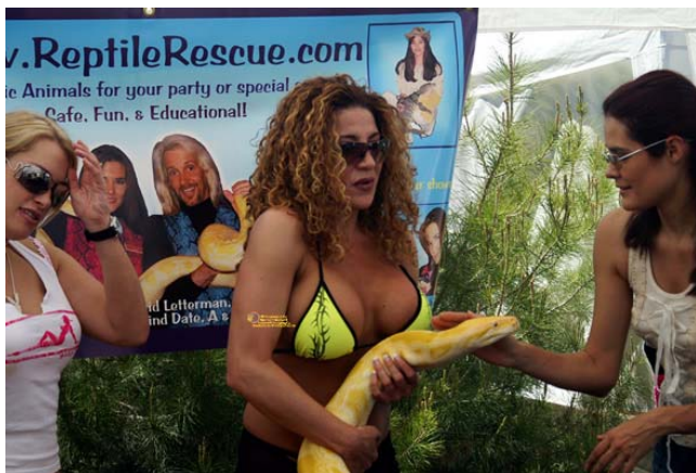
Part of the exhibit at the BBQ included the Snake Babe, seen far right.