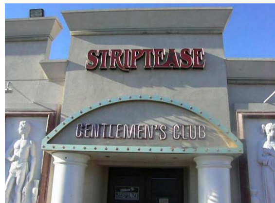
Striptease Gentlemen's Club offers a full bar and beautiful exotic dancers.