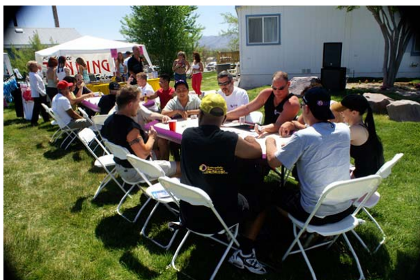
Free Poker Lessons and Play courtesy of NakedFortune was a great thrill for many attendees.