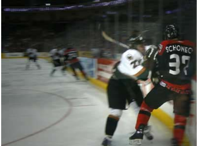
See More Event Photos at <a href="http://www.sincitychamberofcommerce.com/event_page.htm">http://www.sincitychamberofcommerce.com/event_page.htm</a>